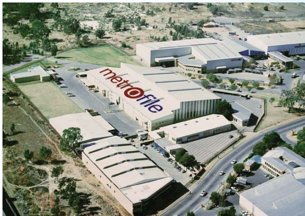
Metrofile Headquarters in South Africa

Metrofile International was established in South Africa. It has gained a wealth of experience since its inception in 1984 and has expanded to Europe and the Middle East.